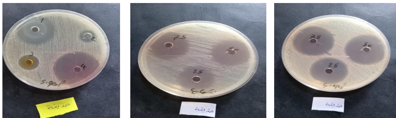
Figure (1) Effect of different fear of nanomaterial on bacterial species Cobalt oxide